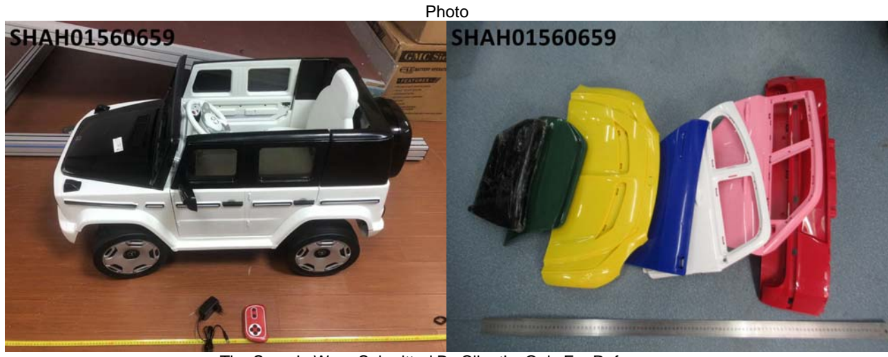
The Sample Were Submitted By Client's, Only For Reference.