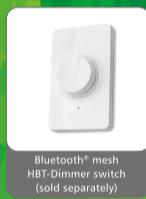
Bluetooth® mesh HBT-Dimmer switch (sold separately)