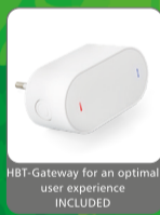
HBT-Gateway for an optimal user experience INCLUDED