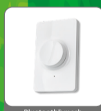
Bluetooth® mesh HBT-Dimmer switch (sold separately)