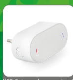
HBT-Gateway for an optimal user experience (sold separately)