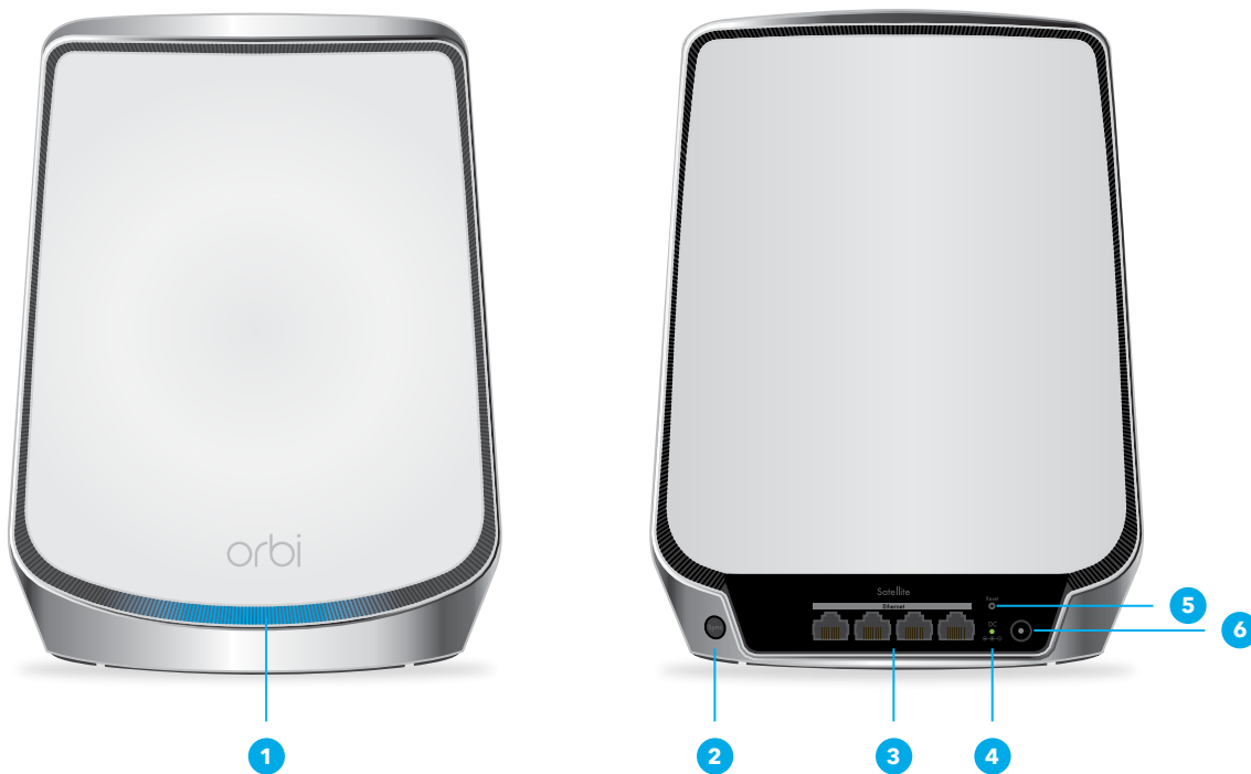
Figure 2. Orbi satellite front and back views

The following figures shows the Orbi satellite hardware features.