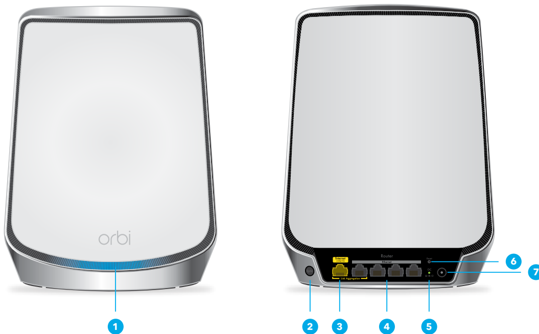
Figure 1. Orbi router front and back views

The following figures shows the Orbi router hardware features.