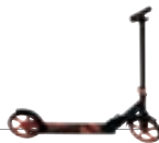
Foldable Scooter RDD AFOLDST05BL