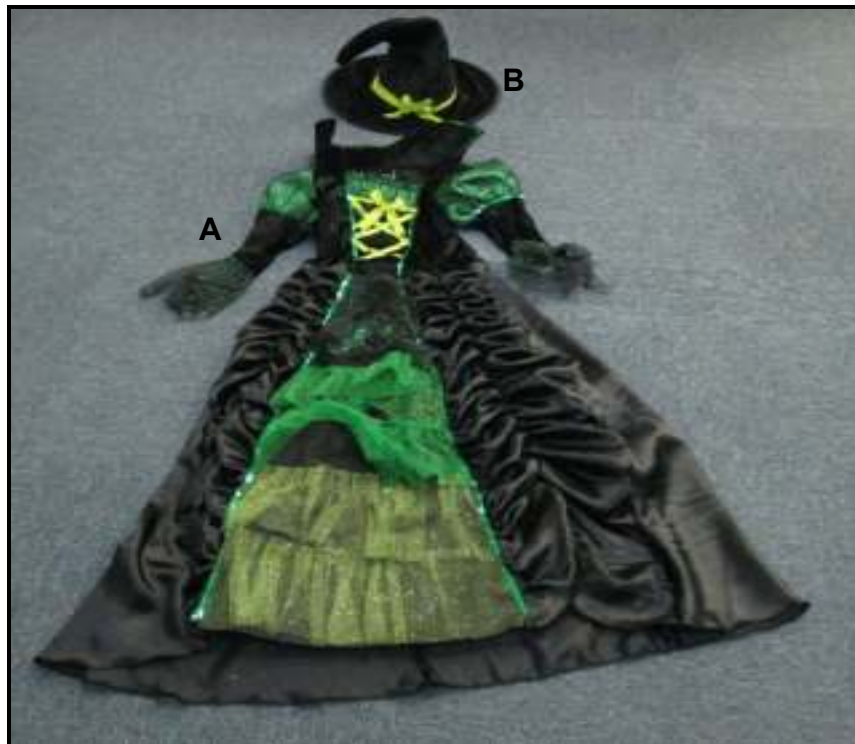
Style No.: C49089