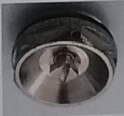
1.9. Ventilating Cap