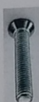
1.8. Hanger Holding Screw

2. According to the pipe lines of your application determine the installation position and level the towel dryer.