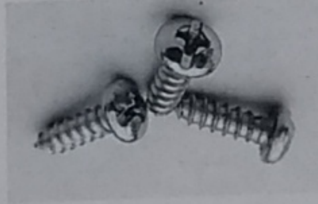
1.7. Hanger Level Screw