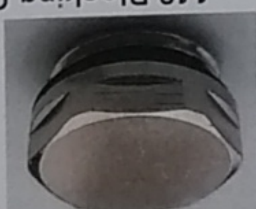
1.10. Blocking Cap