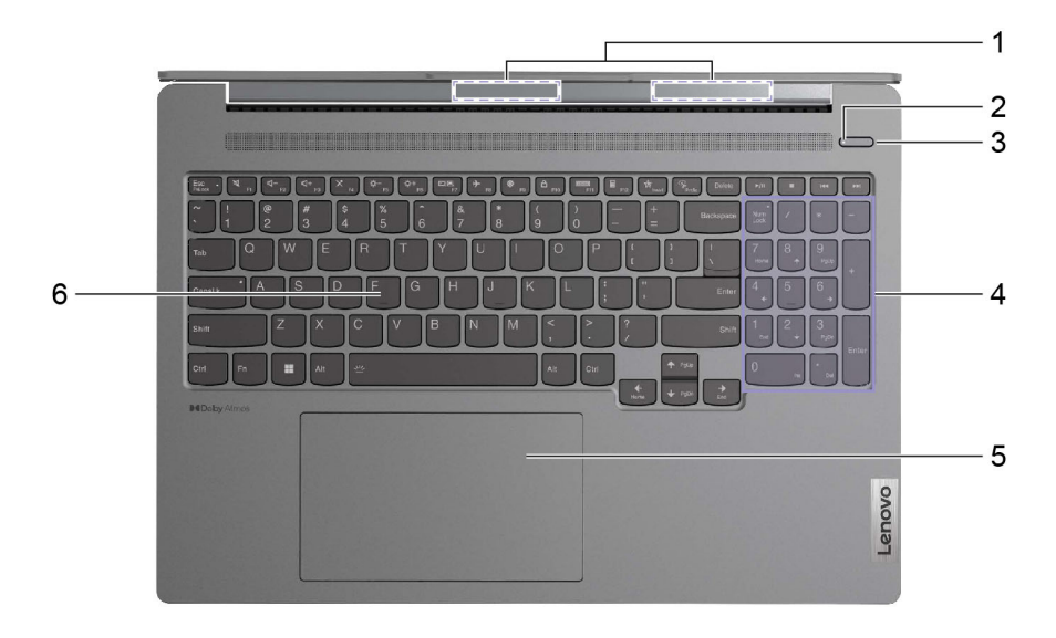
Figure 3. Base view-IdeaPad Pro 5 16IRH8, IdeaPad Pro 5 16ARP8 and IdeaPad Pro 5 16APH8