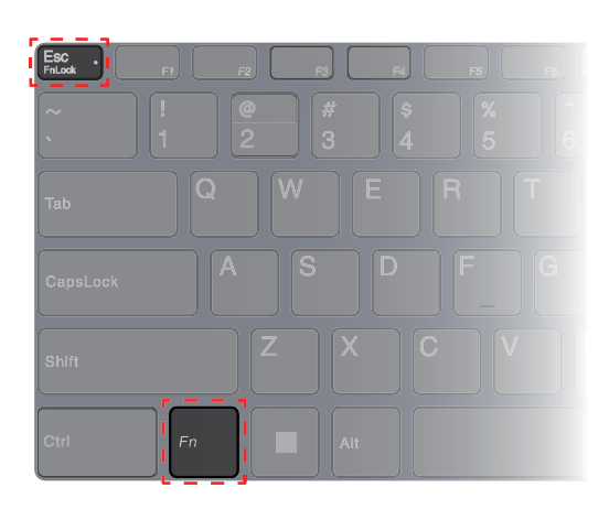
Figure 12. Locations of the FnLock key and the Fn key

Note: The Esc key is in the upper left corner of the keyboard. It has an LED that indicates the status of the FnLock switch.