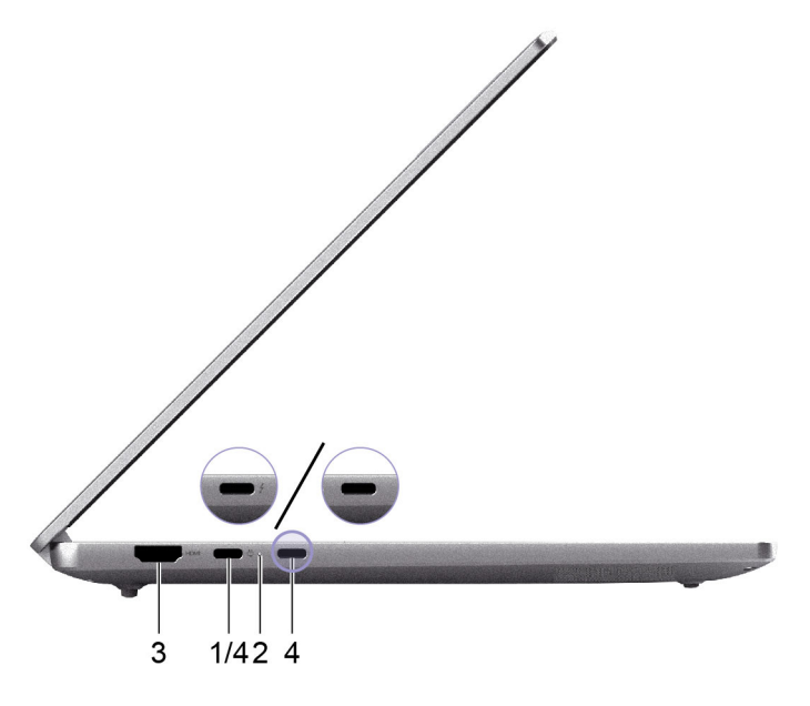
Figure 4. Left view-IdeaPad Pro 5 14IRH8, IdeaPad Pro 5 14ARP8 and IdeaPad Pro 5 14APH8