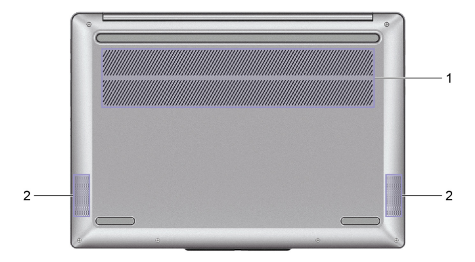
Figure 9. Bottom view-IdeaPad Pro 5 14IRH8, IdeaPad Pro 5 14ARP8 and IdeaPad Pro 5 14APH8