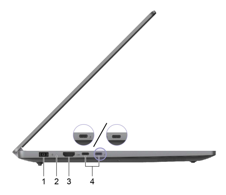
Figure 6. Left view-IdeaPad Pro 5 16IRH8 and IdeaPad Pro 5 16APH8