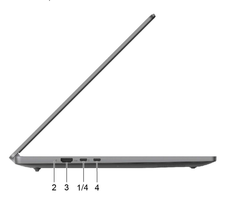
Figure 5. Left view-IdeaPad Pro 5 16ARP8 and IdeaPad Pro 5 16APH8