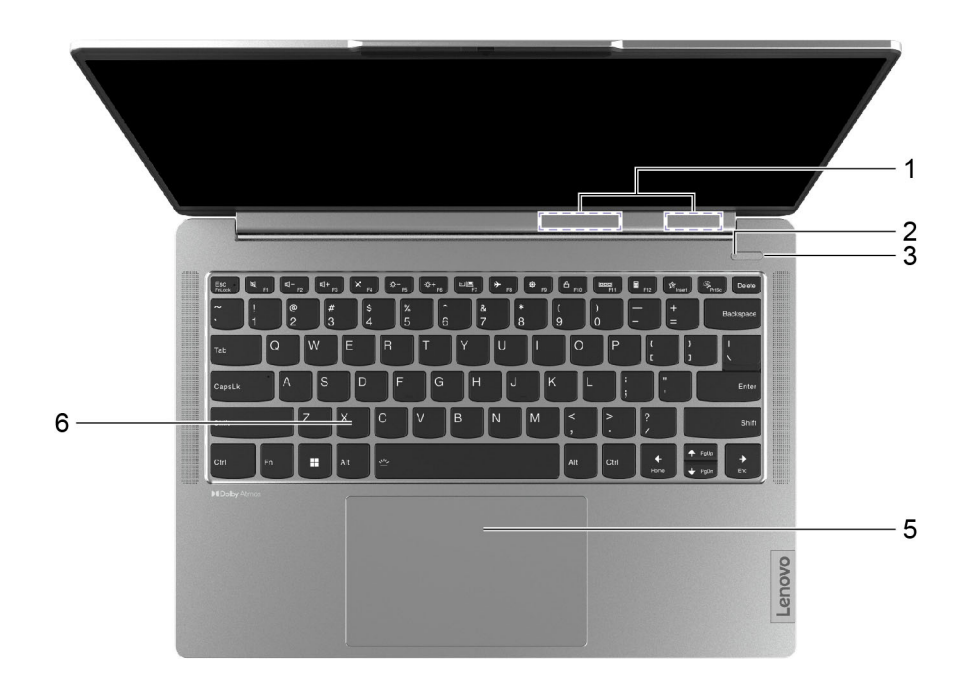
Figure 2. Base view-IdeaPad Pro 5 14IRH8, IdeaPad Pro 5 14ARP8 and IdeaPad Pro 5 14APH8