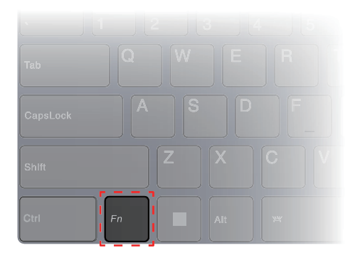
Figure 11. Location of the Fn key

Note: The FnLock switch does not apply to hotkeys not found in the first row of the keyboard. To use these hotkeys, always hold down the Fn key while pressing the key.