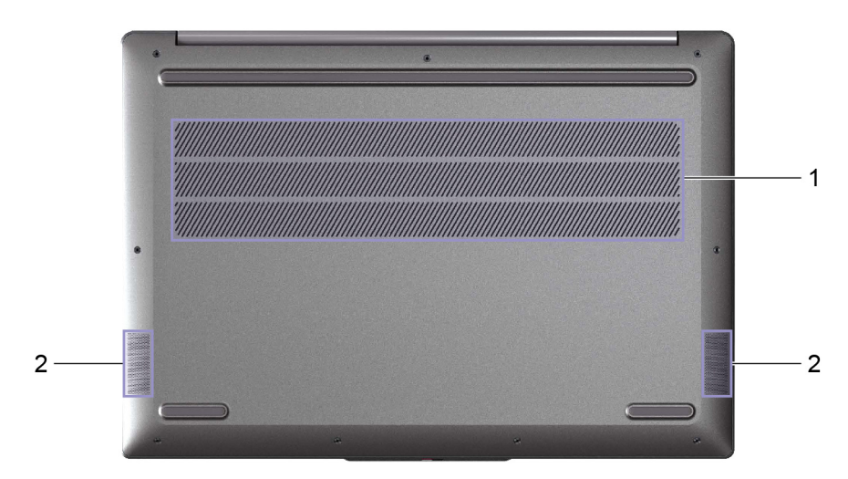
Figure 10. Bottom view-IdeaPad Pro 5 16IRH8, IdeaPad Pro 5 16ARP8 and IdeaPad Pro 5 16APH8