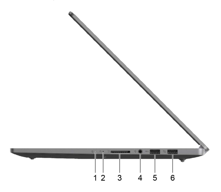
Figure 8. Right view-IdeaPad Pro 5 16IRH8, IdeaPad Pro 5 16ARP8 and IdeaPad Pro 5 16APH8