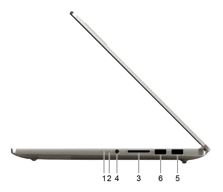
Figure 7. Right view-IdeaPad Pro 5 14IRH8, IdeaPad Pro 5 14ARP8 and IdeaPad Pro 5 14APH8