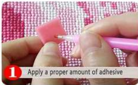
1 Apply a proper amount of adhesive