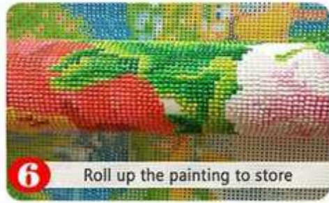
6 Roll up the painting to store