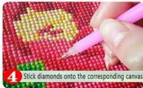
4 Stick diamonds onto the corresponding canvas