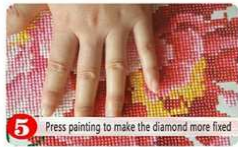
5 Press painting to make the diamond more fixed