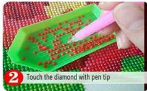
2 Touch the diamond with pen tip