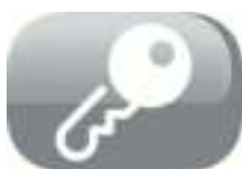
Child proof lock