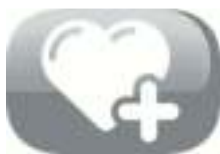
Automatic extension mode