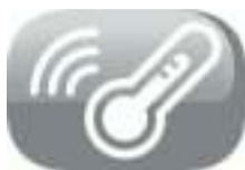
Room temperature thermistor