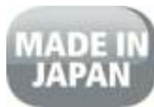
Made in Japan