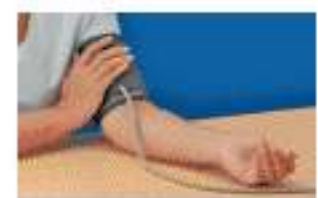
Wrap the cuff and secure comfortably.