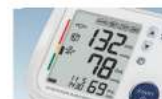
Blood pressure reading and pulse rate are displayed on digital display.