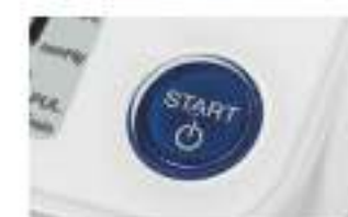
Press START button to automatically inflate the cuff and begin measurement.