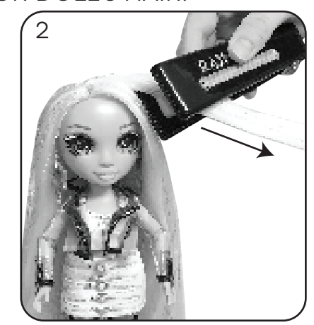
Hold the applicator at the root of the hair, clamp it over the section of hair and firmly pull down to the bottom of the strand. Then, release the hair from the applicator. Repeat as necessary for desired results.