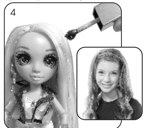
Open the glitter hair gel, and use the applicator brush to apply it to a new section of hair. Add glitter and color to your own hair, just like your doll's hair!