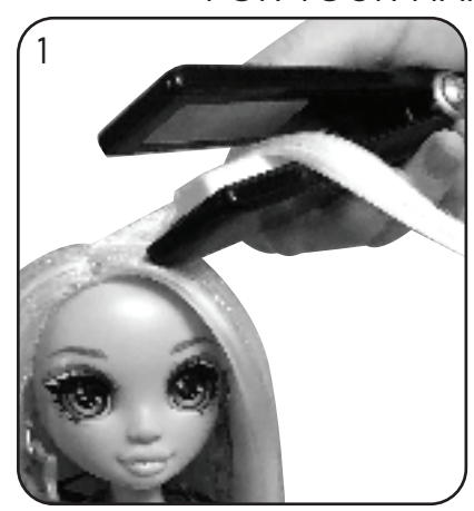
Select a 1/2 inch (12 mm) section of hair, and place it between the plates of the applicator with the chalk on the top side of the hair and the sponge on the underside.