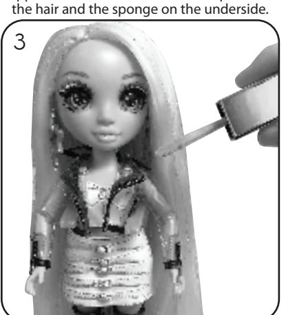
Choose a different section of hair. Open the color hair cream and use the applicator wand to apply color to the strand, working from the root to the bottom.