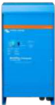
MultiPlus Compact 12/2000/80