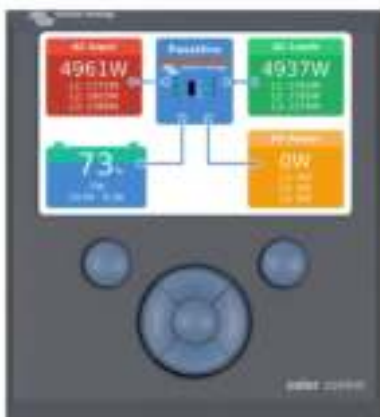
Color Control GX, showing a PV application

When connected to the Ethernet, systems with a Color Control GX or other GX device can be accessed and settings can be changed remotely.