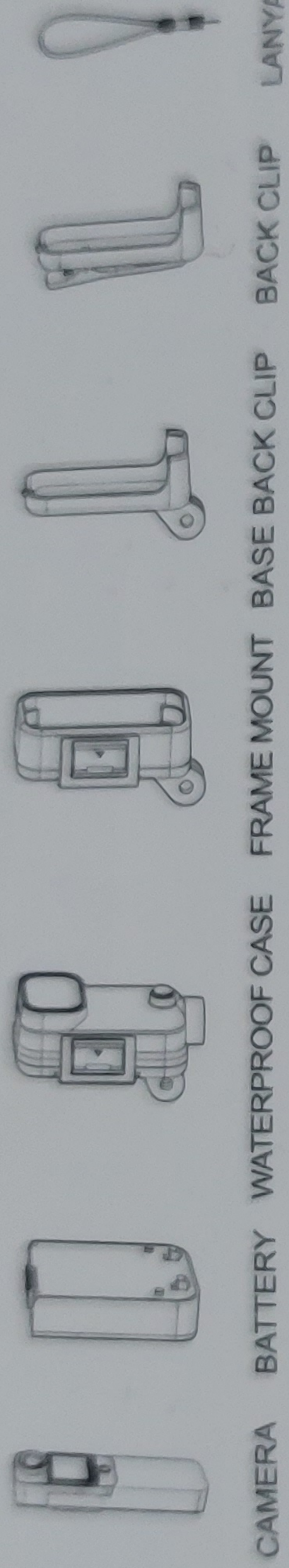
CAMERA BATTERY WATERPROOF CASE FRAME MOUNT BASE BACK CLIP BACK CLIP LANYARD