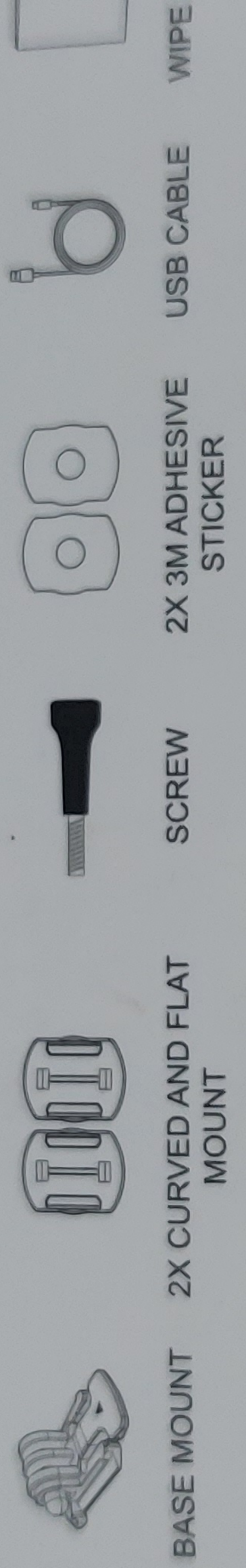
BASE MOUNT 2X CURVED AND FLAT MOUNT SCREW 2X 3M ADHESIVE STICKER USB CABLE WIPE