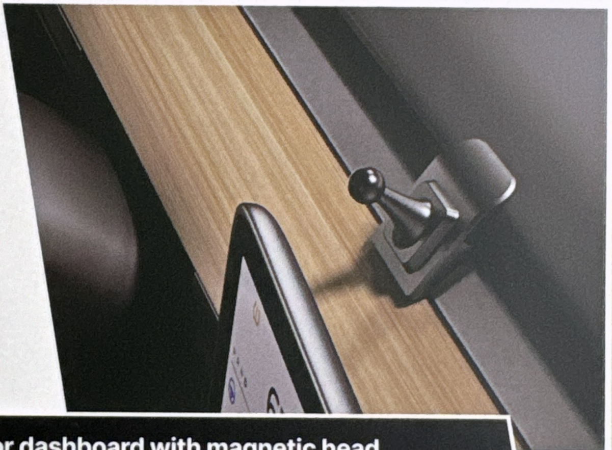
Holder for dashboard with magnetic head Supporto per lo cruscotto con testina magnetica