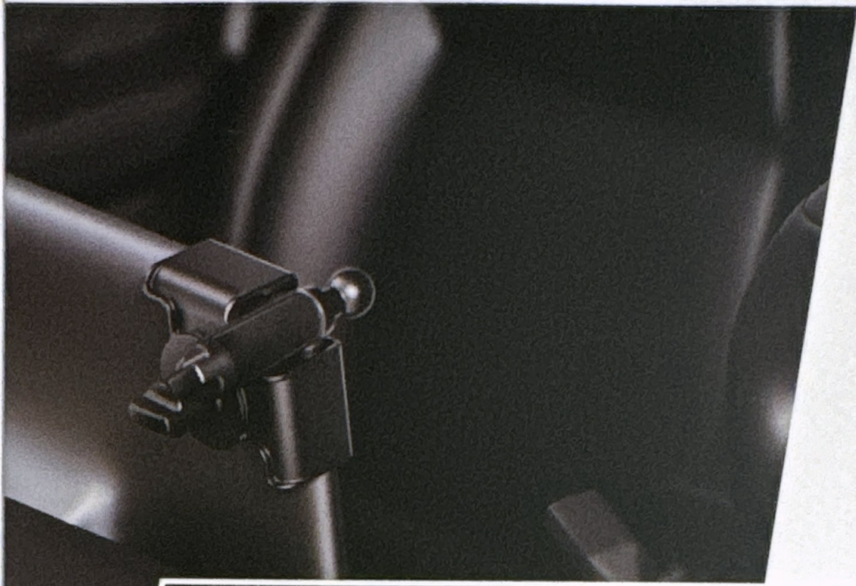
Holder for screen display with magnetic head Supporto per lo schermo con testina magnetica