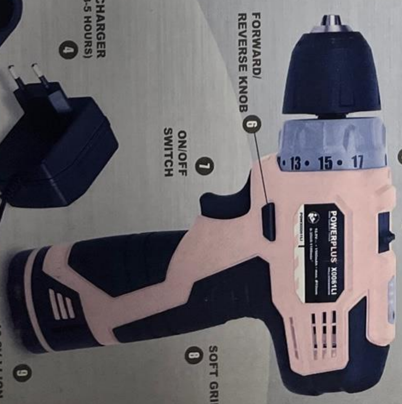
1 ON/OFF SWITCH