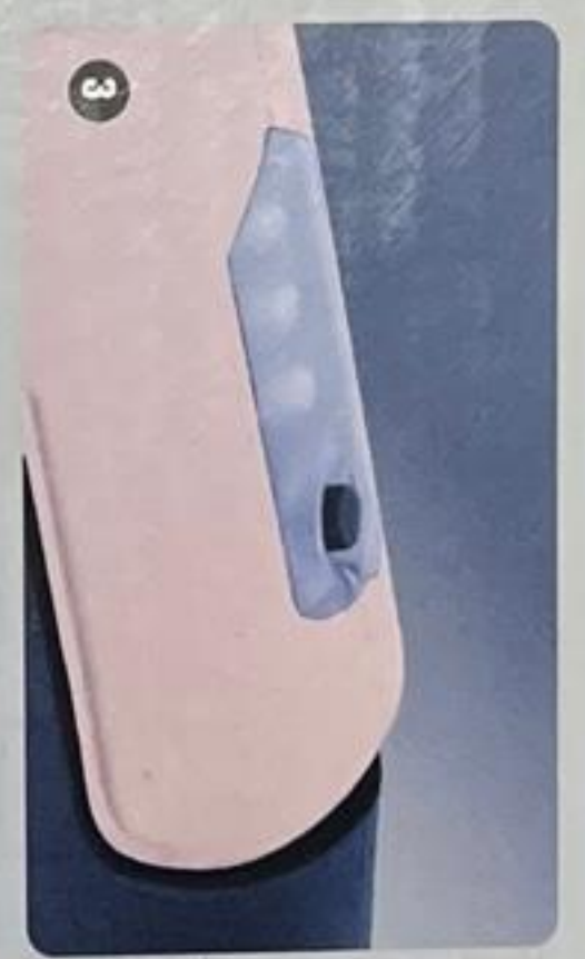
LED BATTERY CAPACITY INDICATOR