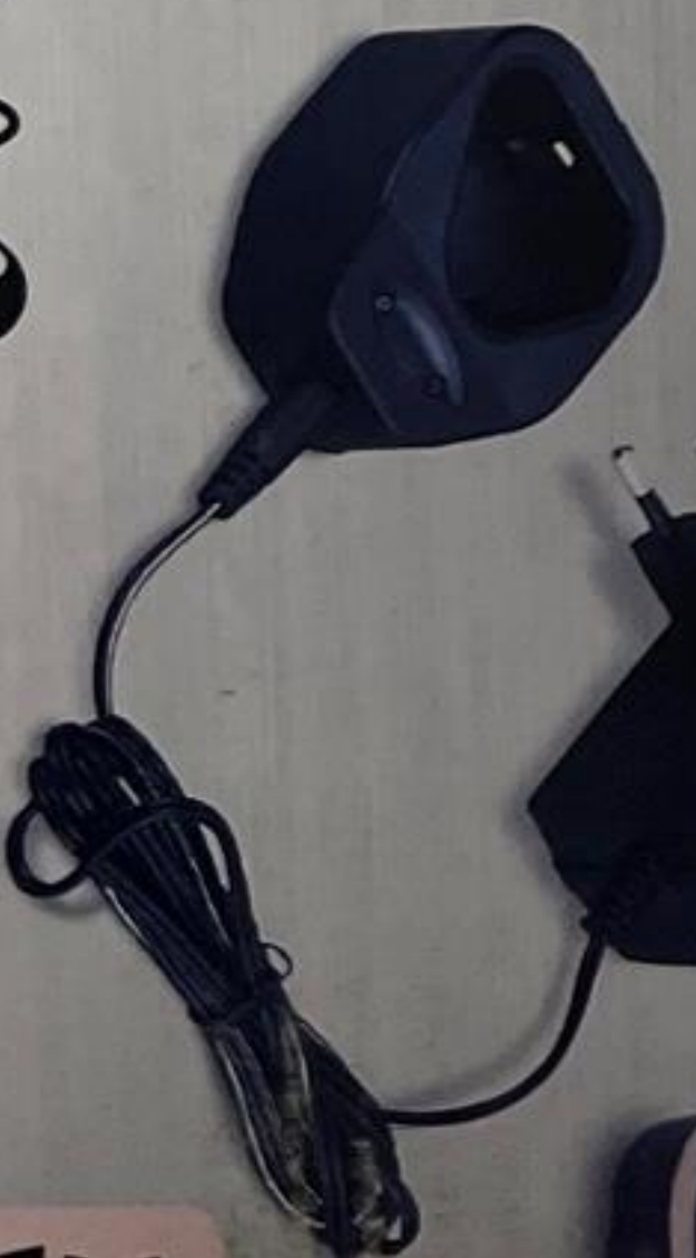
4 BATTERY CHARGER (3.5 HOURS)