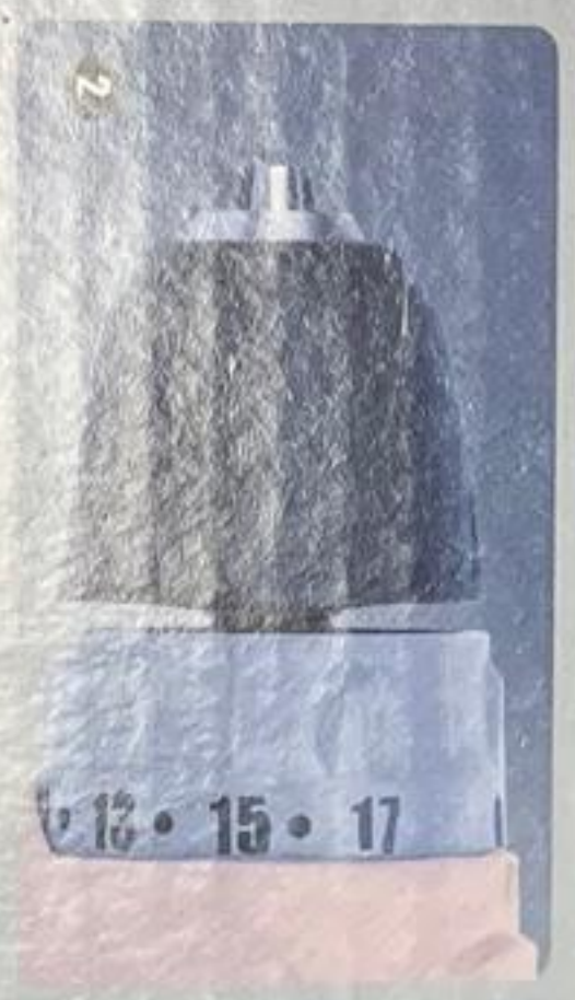
10mm SANOU KEYLESS CHUCK + TORQUE ADJUSTMENT RING