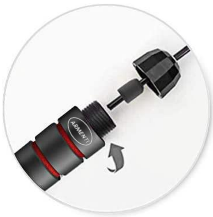
1. turn on the handle cover