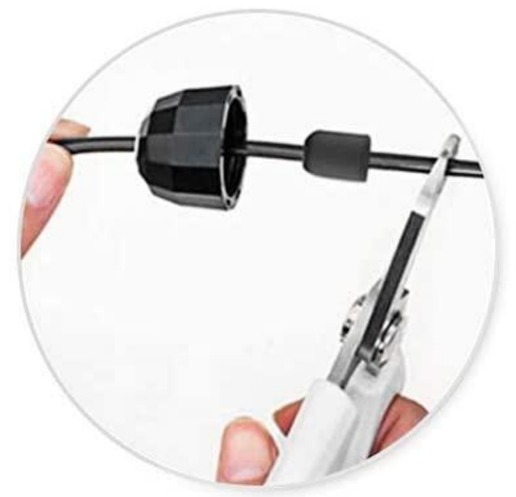
3. Cut of the excess OR fold the excess into the back cover to adjust length