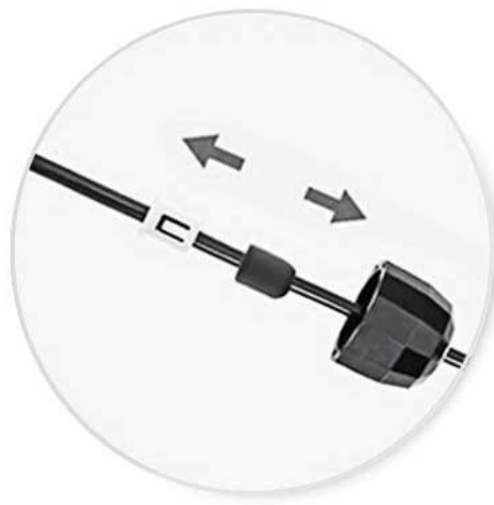
2. Adjust the rope length