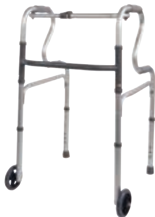
VP179B Dual Riser Folding Walking Frame (Wheeled)

This file is available to view and download as a PDF at www.aidapt.co.uk . Sight impaired customers can use a free PDF Reader (such as adobe.com/reader ) to zoom in and increase the text size for improved readability.