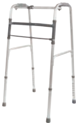
VP129F Folding Walking Frame (Unwheeled)