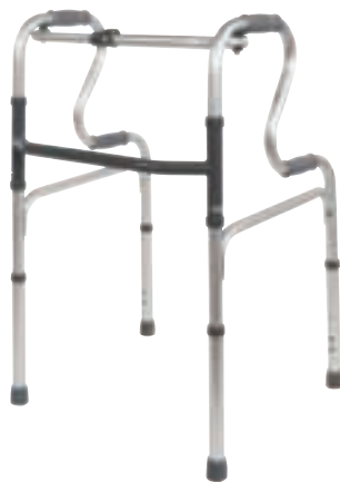
VP179A Dual Riser Folding Walking Frame (Unwheeled)