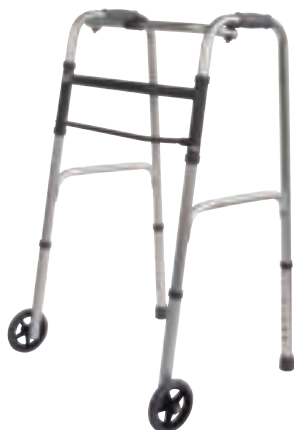
VP129FW Folding Walking Frame (Wheeled)