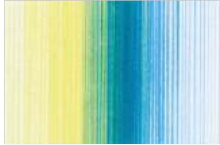
phthalo blue 110 on cadmium yellow 107

Colour gradients can be created by increasing the pressure during drawing, by covering a colour with a white or light colour pencil, or by lightening specific areas with an eraser pencil.