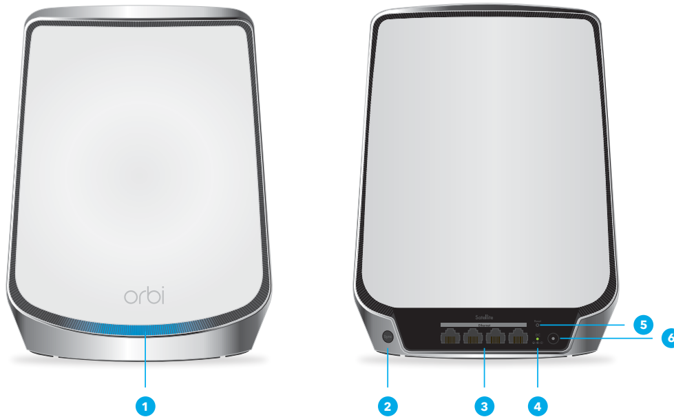
Figure 2. Orbi satellite front and back views

The following figures shows the Orbi satellite hardware features.