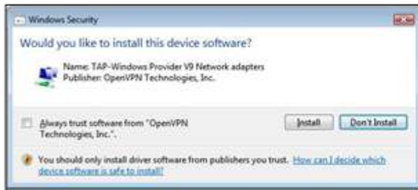
Figure 3. A Windows Security window opens.