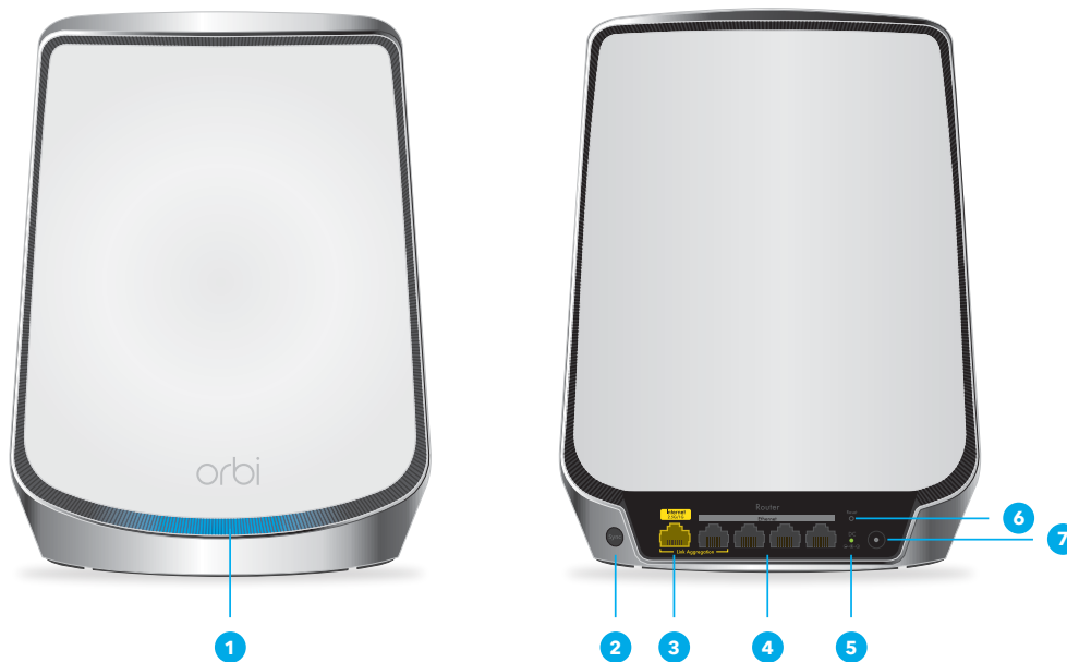
Figure 1. Orbi router front and back views

The following figures shows the Orbi router hardware features.