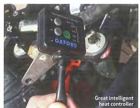
Great intelligent heat controller