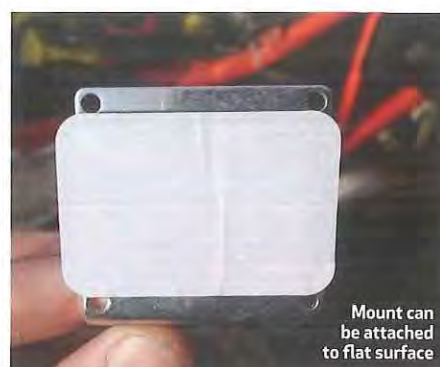
Mount can be attached to flat surface