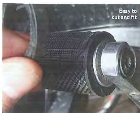
Easy to cut and fit