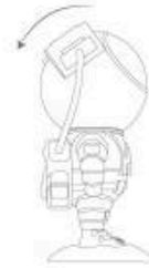
The projection direction can be adjusted by adjusting the rotation angle of the astronaut's head.