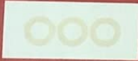
3* Cymbal Washers