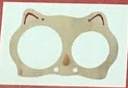
1* Kitten Drum Table