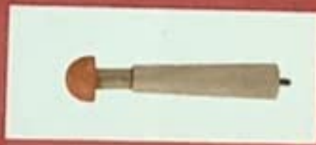
1* Cymbal Stand