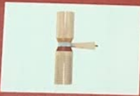
1* Wood Tone Block