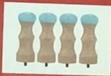
4* Kitten Drum Table Feet