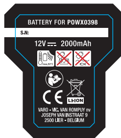
label on battery pack 26.3*30.4mm