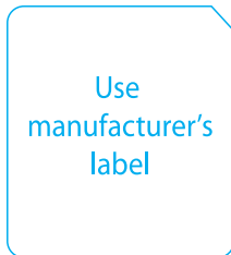
label on power adapter 27.5*30.5mm