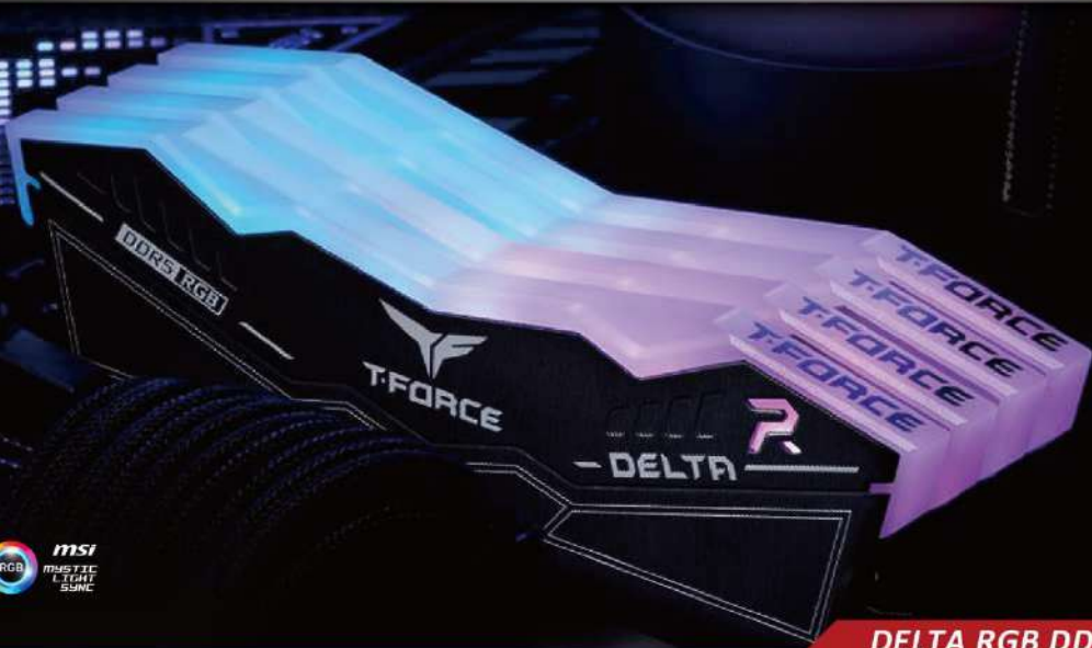
DELTA RGB DDR5

With a refreshing visual experience modeled after a stealth aircraft, the T-FORCE DELTA RGB DDR5 offers a 120° Ultra-Wide Lighting angle that supports lighting software from various manufacturers. In addition to support the latest Intel XMP3.0 one-click OC technology, the DELTA RGB DDR5 is also equipped with PMIC and on-die ECC to ensure stable, efficient power distribution across all components for system stability and performance.