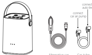
Alternative car cigarette lighter power line