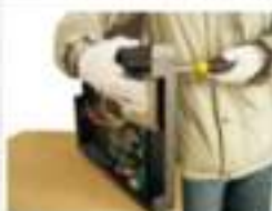
1. Install hard drive for HDD