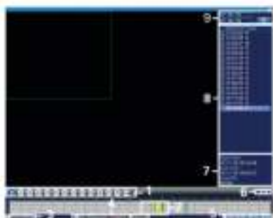
Pic. Record playback