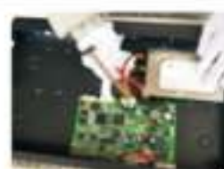
2. HDD data line and power line connection