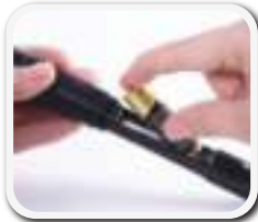
2. Insert a AA battery