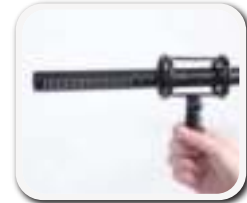
3. Push the mic through shock mount

4. Make sure do not block the slots on the side of the mic, as blocking will effect sound quality and polar pattern. And please remove the battery from mic when the mic isn't in use.