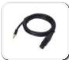
Cable with 3.5mm Plug