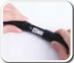
1. Unscrew the battery case