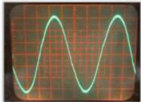
Modified Sine Wave and Pure Sine Waves on Oscilloscope

A modified sine wave inverter can be used for simple systems that don't have any delicate electronics or audio equipment that may pick up the choppy wave and produce a hum. Old tube