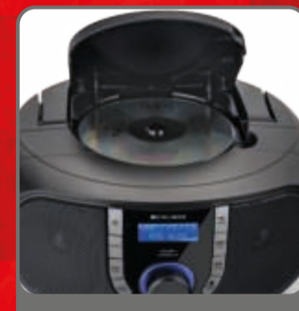
Top loading CD Player