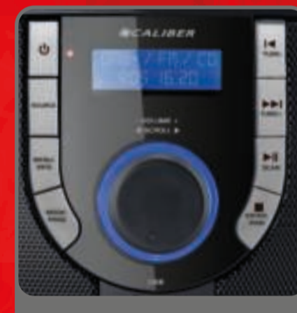
Controls, USB, Display