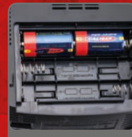
6x 1.5V (C) Batteries (not incl)