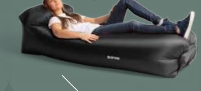
SOFTYBAG - ORIGINAL