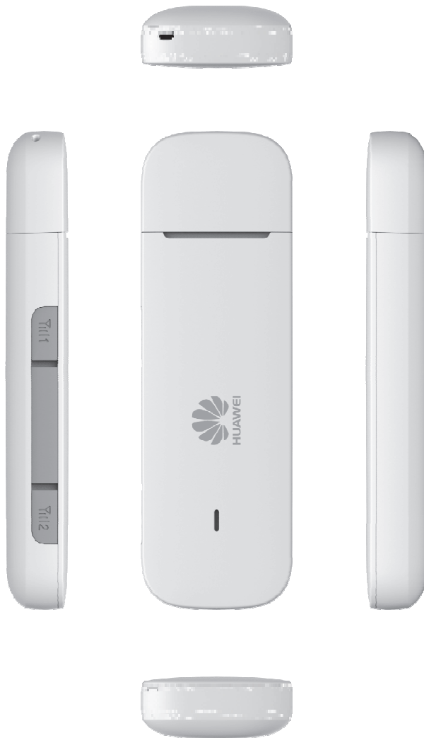
Figure 1-1 E3372h-320 appearance

In the service area of the LTE/DC-HSPA+/HSPA+/UMTS/EDGE/GPRS/GSM network, you can surf the Internet and send/receive messages/emails cordlessly. The E3372h-320 is fast, reliable, and easy to operate. Thus, mobile users can experience many new features and services with the E3372h-320. These features and services will enable a large number of users to use the E3372h-320 and the average revenue per user (ARPU) of operators will increase substantially.