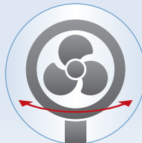
Oscillating (switchable swivel function)