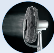
For improved and more pleasant room cooling