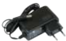
24V 0.38A Power adapter