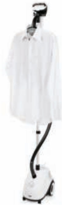
Garment Steamer 01.332848.02.002