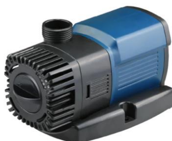
BGPM-1800, BGPM-2800, BGPM-3800, BGPM-5800

Product name : BluFlow Control 1800, BluFlow Control 2800 BluFlow Control 3800, BluFlow Control 5800 Model no. : BGPM-1800, BGPM-2800, BGPM-3800, BGPM-5800