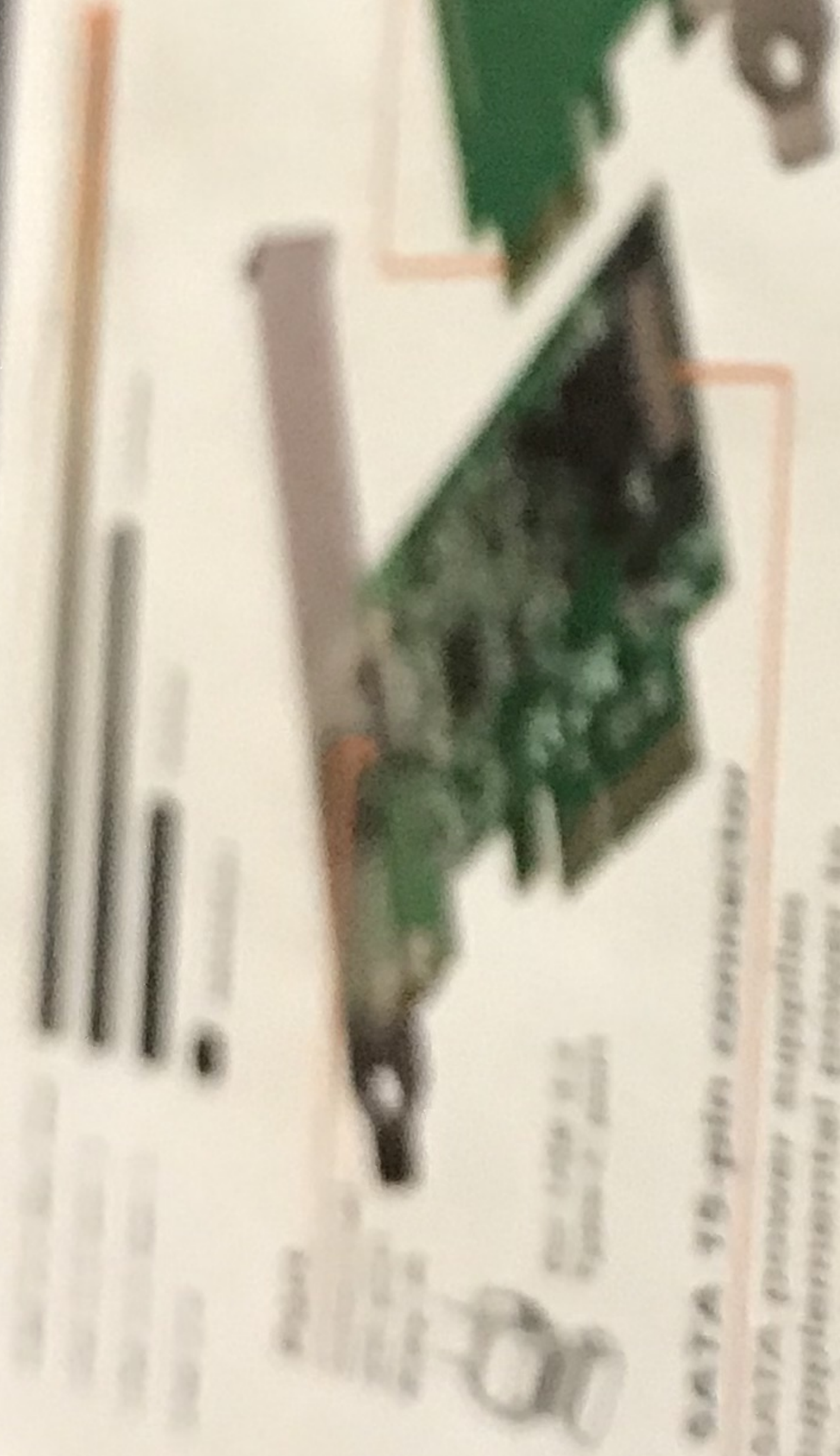
SATA 15-pin connector SATA power supplies supplemental power to the internal 20-pin Key-A port