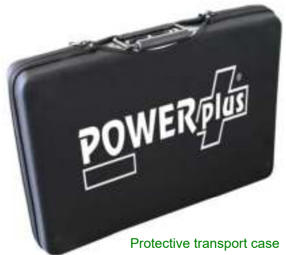
Protective transport case