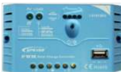
Integrated controller with USB output