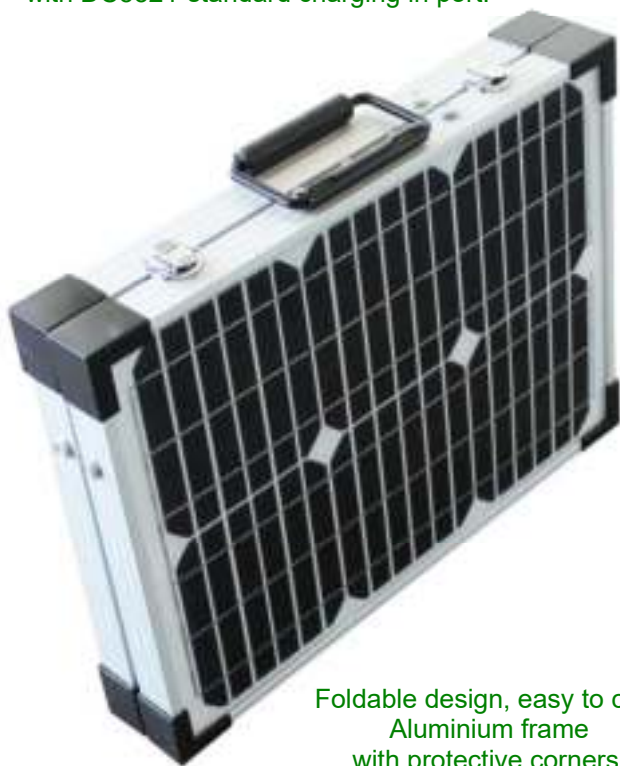
Foldable design, easy to carry Aluminium frame with protective corners

The Python comes with an integrated charge controller with built-in USB output. Besides this, the Python includes a 5 metre total length cable incorporating a 4 metre cable with cable clamps and charging cable and a 1 metre length cable with DC5521 adapter output to charge powerstation with DC5521-standard charging in port.