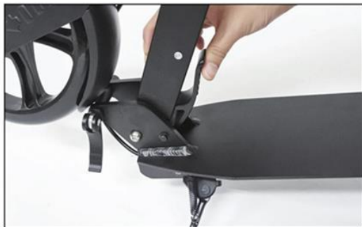
Open the rapid tightening lever and press the folding button to unfold the Scooter.