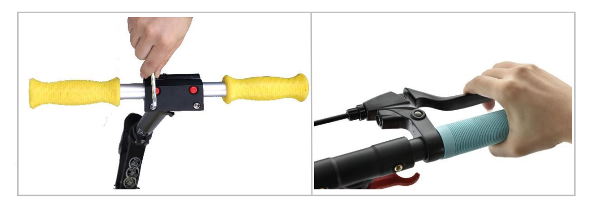
Adjust the lock to tight the T-bar without space, hold the brake handle to restore the brake line.

By opening the quick release, you can adjust the steering to a comfortable height. Make sure the knob snaps into a hole in the steering column. After adjustment, close the quick release.