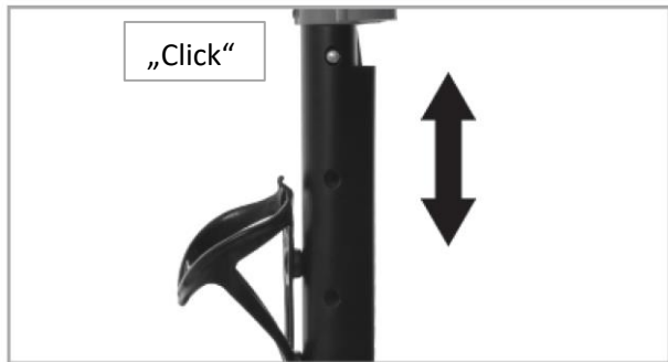
Unlock the rapid tightening lever and open the upper clamp to adjust the height until hear a "Click".