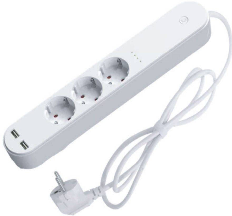
DENVER SHP-310U power plug