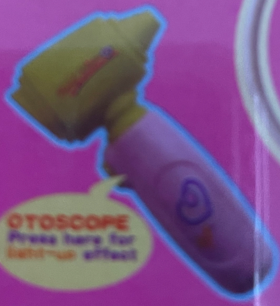
OTOSCOPE Press here for light-on effect