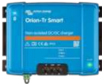
Orion-Tr Smart non-isolated 12/12-30