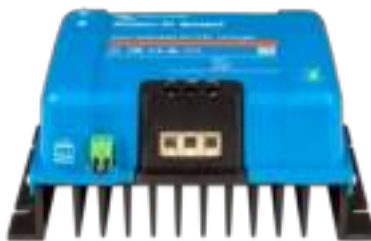
Orion-Tr Smart non-isolated 12/12-30