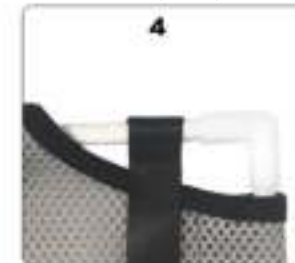
Step 4: Install second layer with support straps.