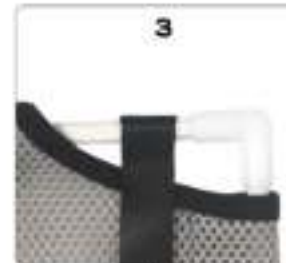
Step 3: Install angle elbows and support straps.