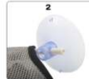
Step 2: Assemble suction cups with long fiberglass tubes.