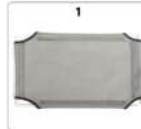
Step 1 : Put the fiberglass tubes into the cushion.