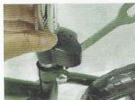
3. Tight the clamp.