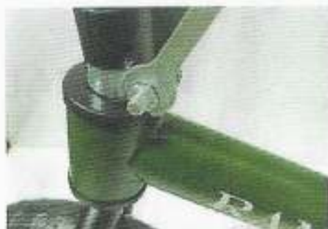
2. Tight the clamp.