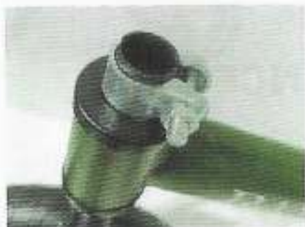
1. Place the steering wheel on the fork.