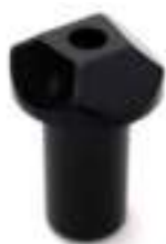
1.4.Hanger Body (b)