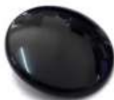
1..5.Hanger Head Cap