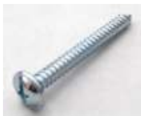
1.2.Dowel Screw (a)