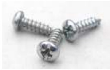
1.7.Hanger Level Screw