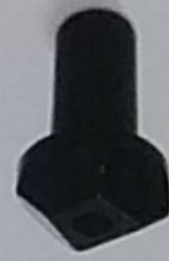
1.4. Hanger Body (b)