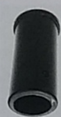
1.3. Hanger Body