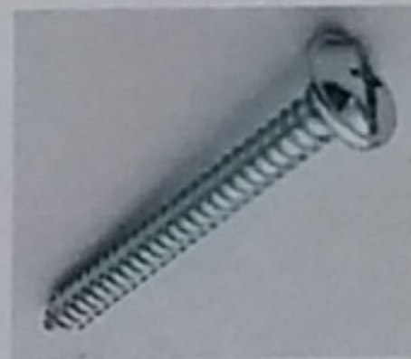
1.2. Dowel Screw (a)