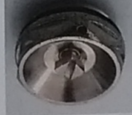
1.9. Ventilating Cap

2. According to the pipe lines of your application determine the installation position and level the towel dryer.