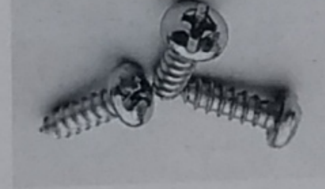
1.7. Hanger Level Screw