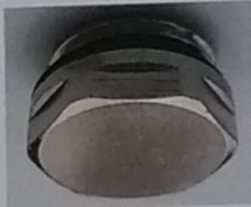
1.10. Blocking Cap