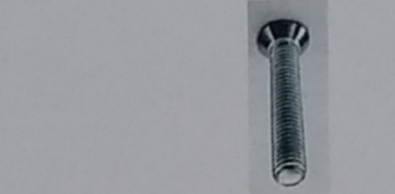
1.8. Hanger Holding Screw