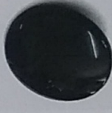
1.5. Hanger Head Cap