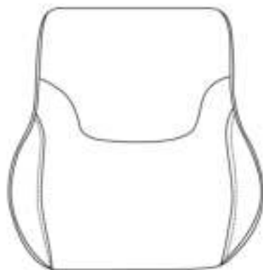
The pictures are for reference only. The products are subject to the actual situation

Thank you for purchasing our massage pillow products. This massage pillow adopts ergonomic design to massage back, waist, buttocks, legs, arms and other parts. It is a massage product with warm feeling and hot compress function. Before use, please read this manual carefully and pay special attention to safety precautions to ensure the correct operation and use of the product. Take good care of the manual for future reference.