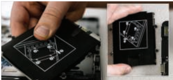
Brackets, adapters, support frames, braces, pull tabs, or screws

When you first slot your SSD into the storage drive bay, it might not fit securely. If this occurs, here's what to do based on the type of system you're installing into.