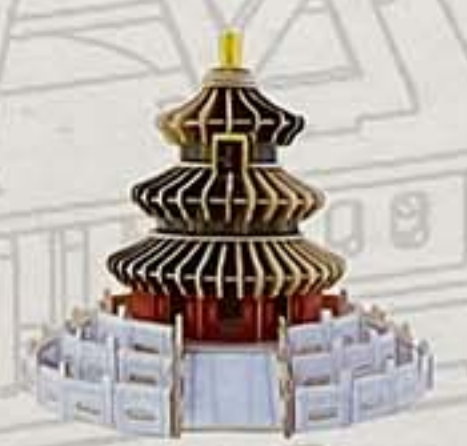
TEMPLE OF HEAVEN