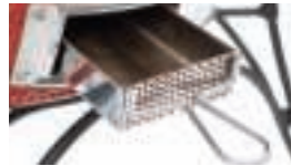
Slide-Out Ash Drawer