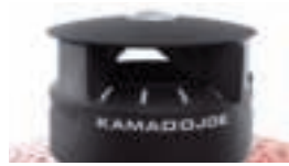
Kontrol Tower Top Vent